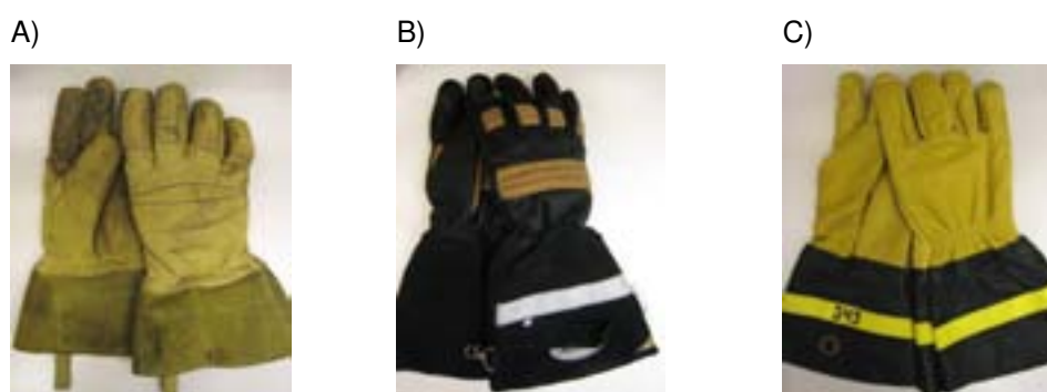
Figure 2. Firefighters' leather gloves (A), firefighters' leather/textile gloves (B), and work gloves (C)

The usability tests were performed using three different glove types: firefighters' leather gloves, firefighters' leather/textile gloves, and work gloves (Figure 2 A–C, Table 2), as well as bare hands, during a simulated communication situation. The work gloves were of various different styles of leather gloves with lining. The size of the gloves was selected on the basis of the size of the users' hands.