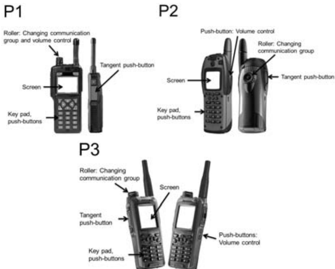
Figure 1. Tested TETRA phones: P1, P2 and P3

The testers evaluated three different TETRA phones, P1, P2 and P3 (Figure 1). These phone models are typically used in one Rescue services district in Finland. Their dimensions and weights are shown in Table 1. The average weight of the phones was 279 g (SD 9 g).