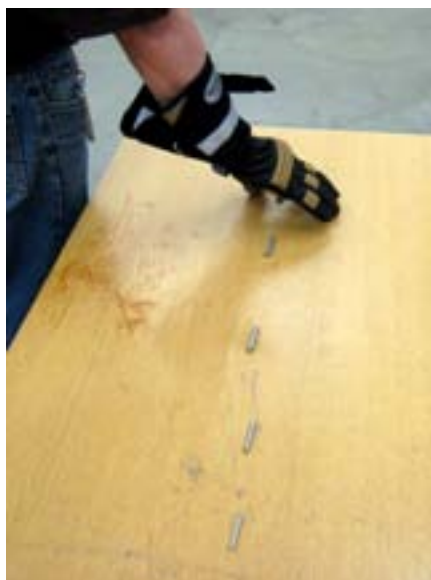
Figure 4. Finger dexterity tests with different gloves using five test pins

The tests were performed with five centerless ground stainless steel test pins. The tester picked up a pin by its circumference between his gloved forefinger and thumb without any other means of assistance (Figure 4). The same pin had to be picked up three times within 30 seconds without undue fumbling. The pins were 40 mm long and 5 mm, 6.5 mm, 8 mm, 9.5 mm and 11 mm in diameter. They were not conditioned before testing. The tester was kept in thermal balance during the tests by sufficient clothing and by breaks between tests in warm conditions. The result value, i.e. level of performance (Table 3) corresponds to the smallest diameter of pin that was picked up according to the test procedure. The results are given as means ( \pm SD) of each different glove type ( n=3 per glove types).